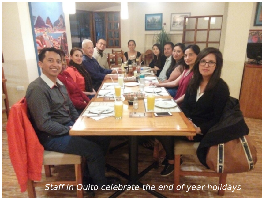
Staff in Quito celebrate the end of year holidays

It was not until January of 2007 that we actually received the papers from the Ministerio de Bienestar Social, legalizing Yanapuma as a non-profit NGO.