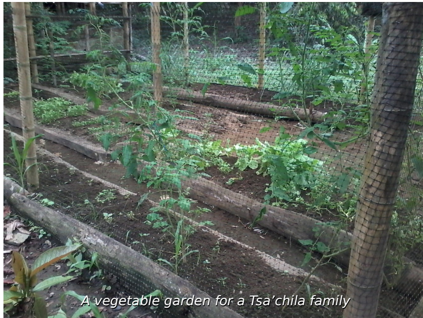
A vegetable garden for a Tsa'chila family

We were delighted to receive additional funding for the project with the Tsa'chila from the Alan and Nesta Ferguson Charitable Trust. They had awarded us a grant four years ago for working on vegetable gardens and nutrition