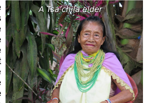
A Tsa'chila elder

education with the Tsa'chila and it was this project that planted the seed for future development of the vegetable growing that we have done over the following years. With the new award of £10,000 we will be able to continue funding the program as the funding from the IAF begins to run out.