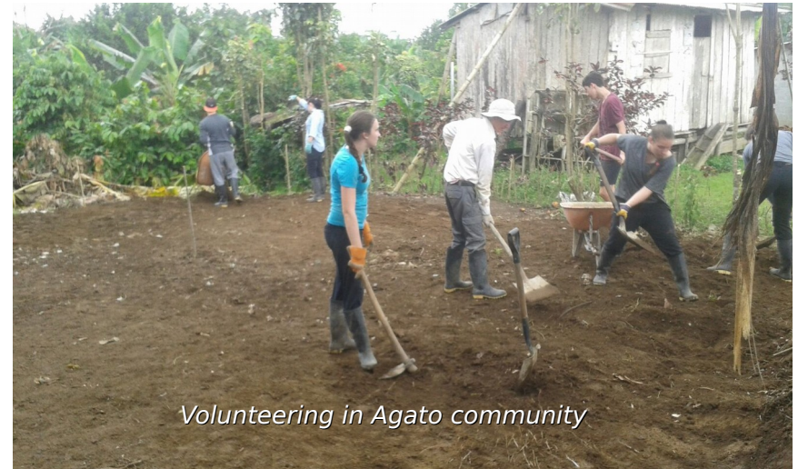
Volunteering in Agato community

year, and unfortunately have not been able to continue their work with the Tsa'chila culture in reforestation. However, the Leap groups were mainly involved in planting out trees in the Tsa'chila communities as part of our "edible forest" program that you can read about under the foundation chapter below.