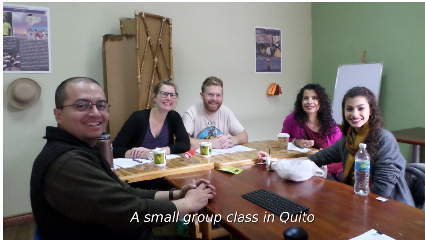
A small group class in Quito

represented 100% of our income, but in 2016 we estimate that it has been around 25%.