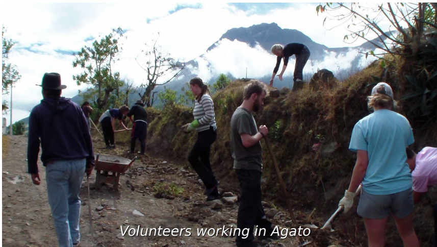
Volunteers working in Agato

One of our ongoing challenges in Estero de Plátano is to help the community to create sustainable sources of income