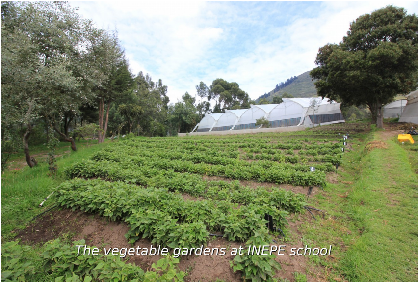
The vegetable gardens at INEPE school

Groups also visited the Galapagos Islands to work on the Hacienda Tranquila project on the island of San Cristóbal. This is focused on conserving the delicate ecosystems of the island by removing invasive species which is a rather never-ending process. The local tortoises depend on the native plants for their sustenance and as these get displaced by the invading species their food source diminishes to the point where they cannot find enough to eat.