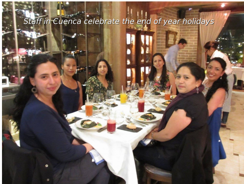
Staff in Cuenca celebrate the end of year holidays

Part of our response has been to focus on the development our own travel agency – True Ecuador Travel – dedicated to developing programs of educational travel with universities, high schools, other organizations as well as individual clients. Thus the Spanish school becomes part of a wider set of activities for visitors, including volunteering, with