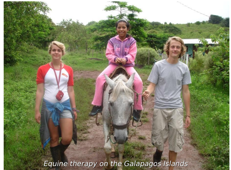
Equine therapy on the Galapagos Islands