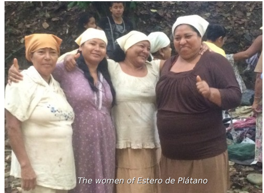
The women of Estero de Plátano

Later in the year we learned that this is the last year that Union College will be sending interns to Estero de Plátano.