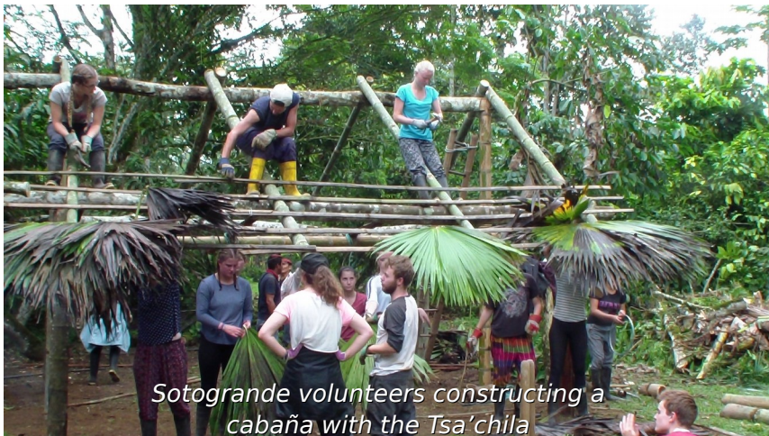
Sotogrande volunteers constructing a cabaña with the Tsa'chila

August. They work with the scholarship recipients to