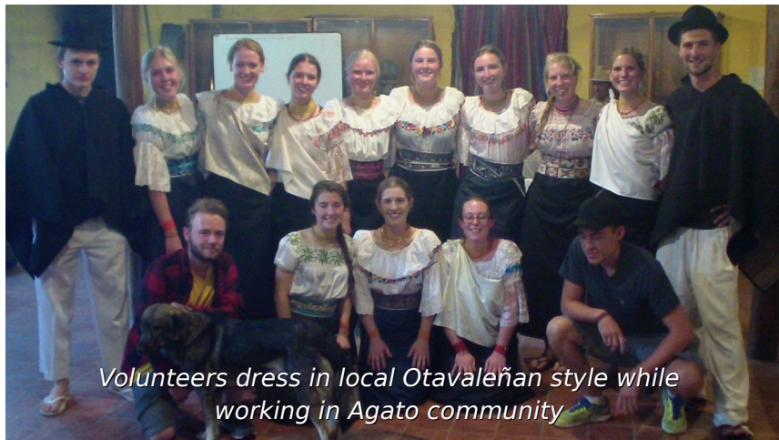
Volunteers dress in local Otavaleño style while working in Agato community

Thinking Beyond Borders, who have sent us groups for the past 8 years, reorganized their round-the-world program this